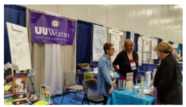
UUWF booth at GA 2016

We also enjoyed visiting with people at our booth in the Exhibit Hall, where we collected your questions for our UUA Presidential Candidates who, for the first time, are all women.